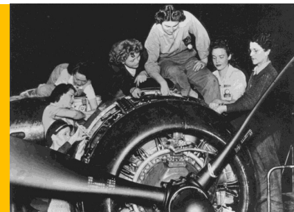
Meet the Tinker Rosies The first all-female engine crew at Tinker Air Force Base, Okla., works on a B-25 engine in 1943. #WomensHistoryMonth