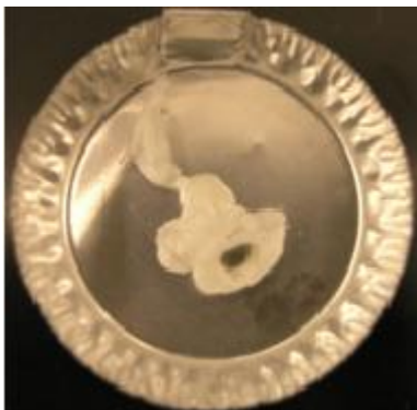
Figure 1. Thiol- arsenic complex synthesized.

The effects of various parameters (e.g., pH, temperature, different cross-linker, reaction time) were analyzed to find out the optimal conditions. ICP-OES analysis was carried out to see the binding of arsenic with the polymer.