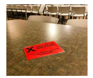
Table sign, food court, May 2020.

Nearly empty Memorial Union, November 2020.