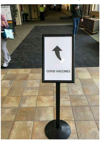
A new semester begins, September 2020.

Free Covid vaccinations at Memorial Union, May 2021.