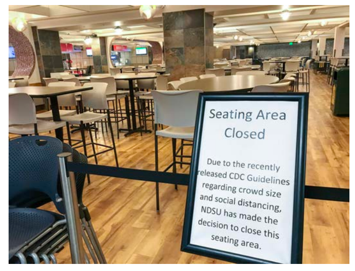
Closed food court, April 2020.