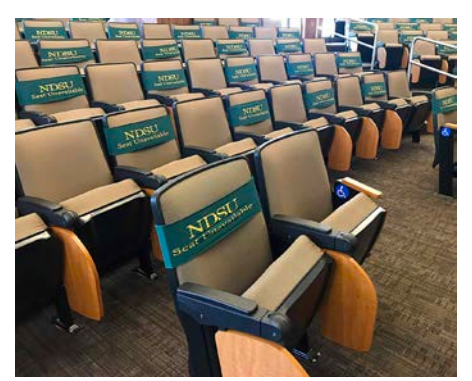
Minimum social distancing requirements enforced, Minard Hall, September 2020.