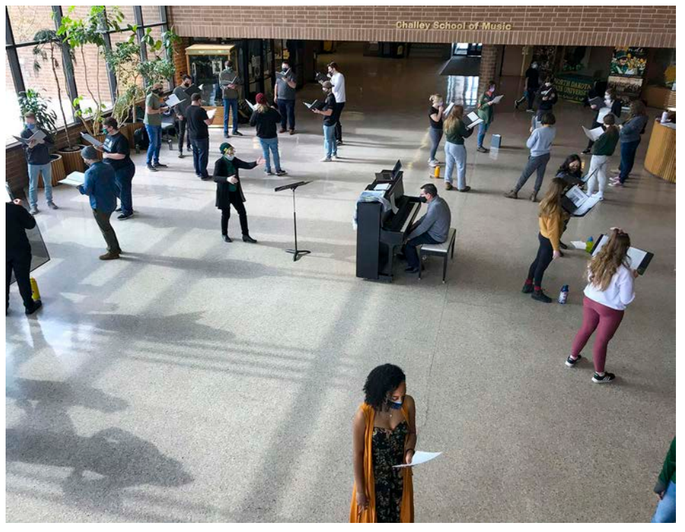
NDSU choir practice, Reineke Fine Arts Center, February 2021.