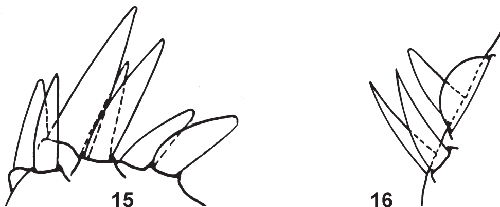
Figs. 15-16. Systelloderes loebli sp. nov., holotype, female, right fore leg (anterior view); vestiture omitted. 15 – apicitibial armature; 16 – tarsal armature.

two-segmented, segment 1 extremely short, without dorsal surface in lateral view (dorsal part of segment 1 visible as dorsal part of basitarsal ring filling up apex of tibia in anterodorsal view). Apices of both middle and hind tibiae each with strikingly short posteroventral and anteroventral setal combs; every comb terminating ventrally with a long spiniform seta. Claws and parempodial setae isomorphic.