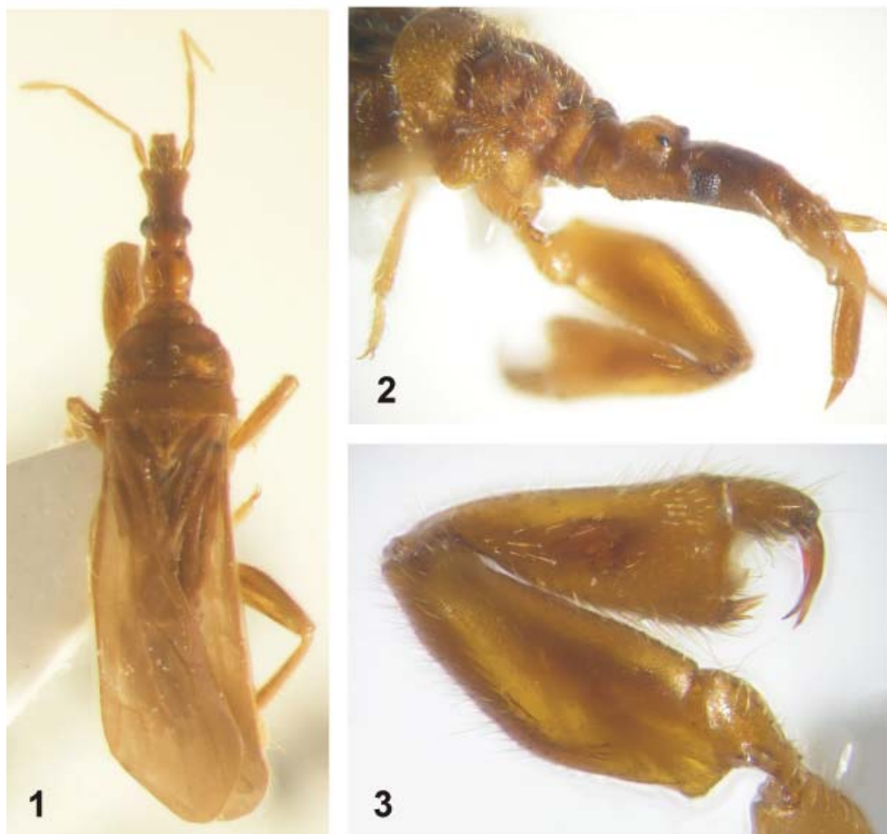
Figs. 1-3. Systelloderes loebli sp. nov., holotype, female. 1 – total view; 2 – head, lateral view; 3 – right fore leg, anterior view.

broadly convex, interrupted, slightly notched because of lateral pits; posterior margin entire, trisinate, sublateral shallowly concave parts slightly depressed, medial convex part broadly rounded, without edge. No traces of Y-shaped impressions. Constriction between midlobe and hindlobe broad, sharply demarcated. Midlobe 2.5 times as long as collum, 1.2 and 1.45 times as long as hindlobe maximum and median length, respectively. Midlobe 2.0 times as long as wide. Hindlobe ample, its median twice as long as collum, indicated neither by ridge nor impression, lateral margins rounded, posterolateral angles (in strictly dorsal view) subrectangular; posterior margin bisinate (tetrasinuate, if moderately protruding posterolateral angles are counted), medially broadly and shallowly concave, moderately convex sublaterally. Hindlobe 3.2 times as wide as medially long. ' Proepimeral lobe ' (see ŠTYS & BAŇAŘ 2006) extensive, distinctly exceeding posterior prosupracoxale posteroventrad, but not enclosing fore acetabula. Mesoscutellum . Concave central part equilaterally triangular,