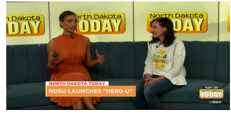
North Dakota Today - NDSU launches Herd U