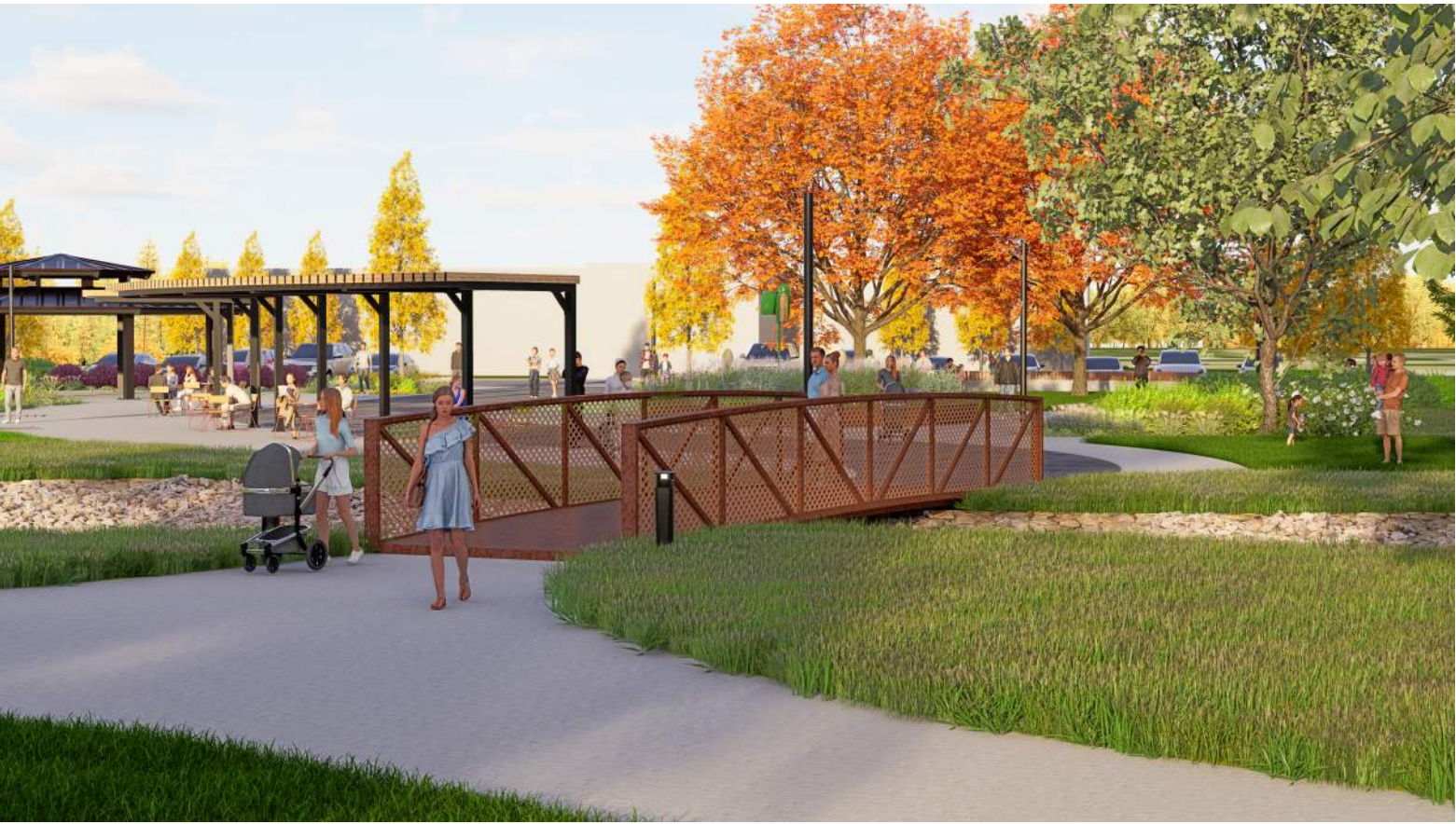
(P.4) View from the open lawn facing the main entry plaza and existing building.