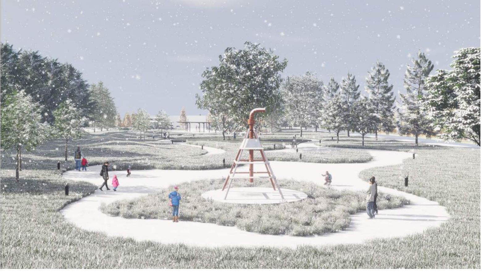
(P.6) Winter scene of the park.