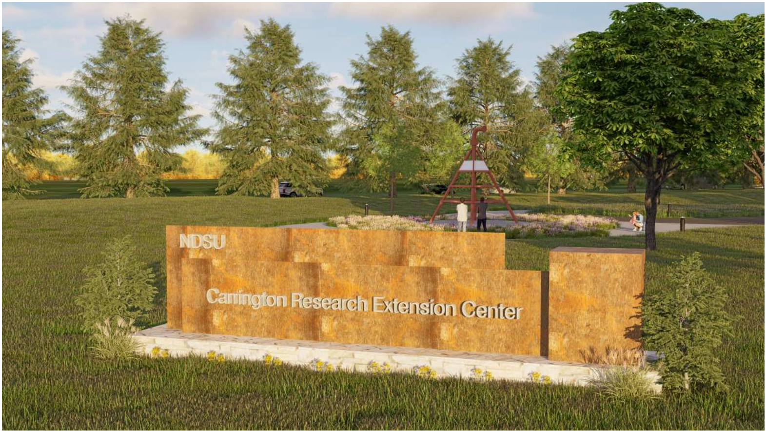
(P.3) Signage to be placed on the northeast and southeast corners of the site.