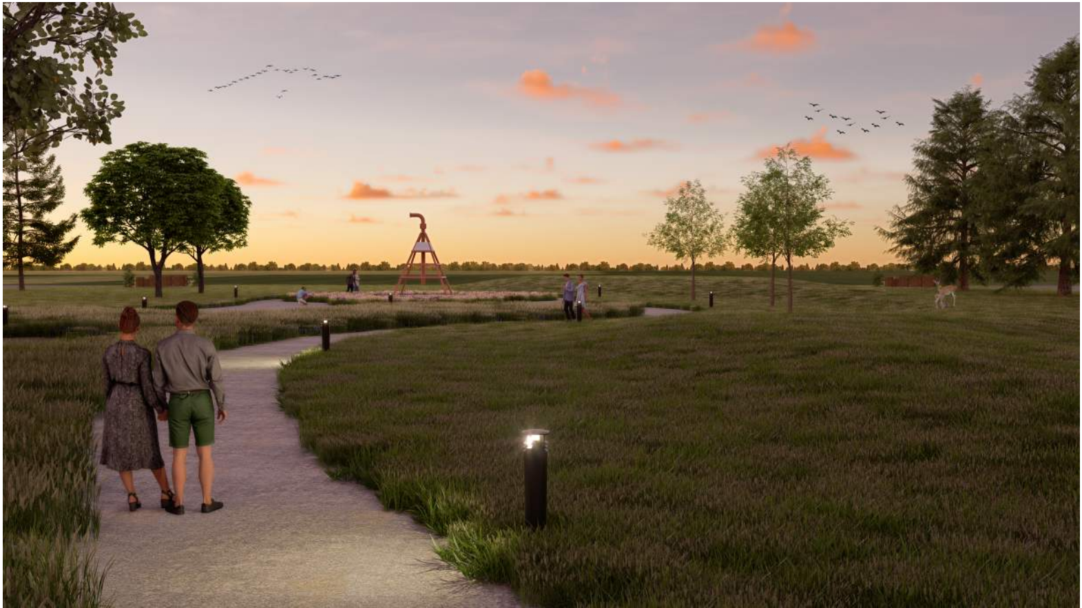
(P.5) Irrigation feature shown at sunrise.