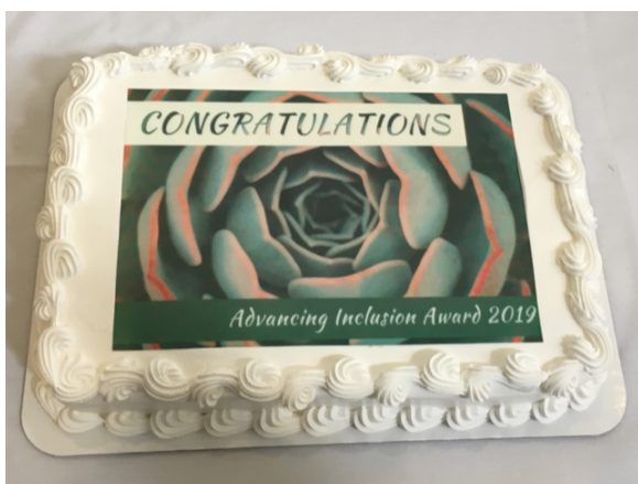
The amazing cake that the department enjoyed after the award ceremony on May 02, 2019