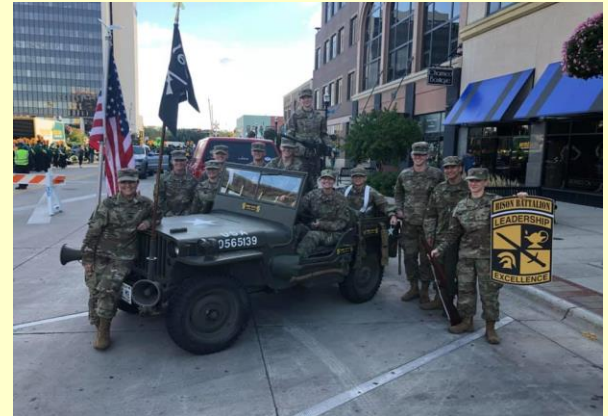
The Bison Battalion participates in the 2018 Homecoming Parade with WWII Willy's Jeep