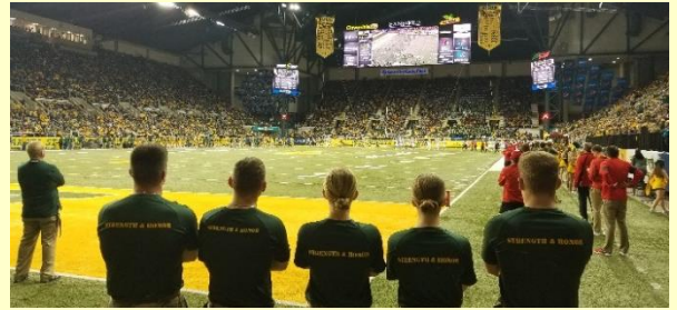
Cadets working the field goal nets at a Bison home football game

Anyone looking around a college campus cannot help but notice every student experiencing college in their own unique way. For an Army ROTC Cadet, that couldn't be truer. While their fellow students lay comfortably in their beds, ROTC Cadets are waking up at 0500 to do PT. Life continues to differ in many ways. They extend the normal college experience by running marathons they never thought themselves capable of, building lifelong friendships through rigorous training, and competing as a cohesive team. Many get their first taste of Army life through ROTC and historical customs like the Military Ball. For cadets, these enrichment opportunities support personal and professional development while on the road to becoming Army Officers. On campus, cadets become students who are not only prepared for anything life throws at them, but are able to confidently lead others into that fray as well. As a Cadet, we are future leaders of character who are disciplined, resilient, and prepared for the future.