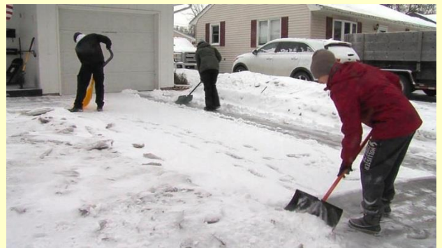
Cadets shoveling a Veteran's driveway for Operation Snow Angel

This past year the Bison Battalion Cadets reached out and helped out local community veterans and alumni as well as sponsored several blood drives at NDSU. Operation Snow Angel was a resounding success among the veterans who signed up to have our students come and assist with cleaning their driveways during major snow storms. Cadets also volunteered to assist multiple veteran or alumnus with local moves within our community. In addition, our cadets volunteered or worked with several veteran organizations this past year to include Honor Flight, ROA, and VFW.