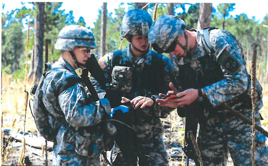
Cadets reviewing their notes prior to a mission at this Spring's CFTX.

Goes to NDSU as a Business Management student and is a SMP Cadet with the MN National Guard. He plans to branch Intelligence after graduation in December 2017.